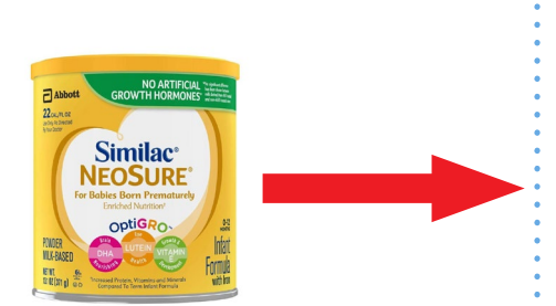
Similac NeoSure Powder